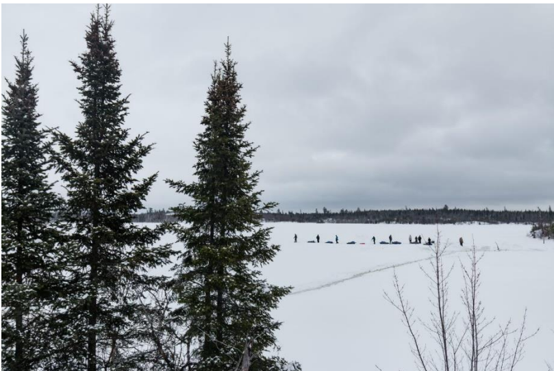
Northern Tier Participant Handbook 2022-23 – page 10

The answers to these questions will be used to plan your trek on the day you arrive at Northern Tier.